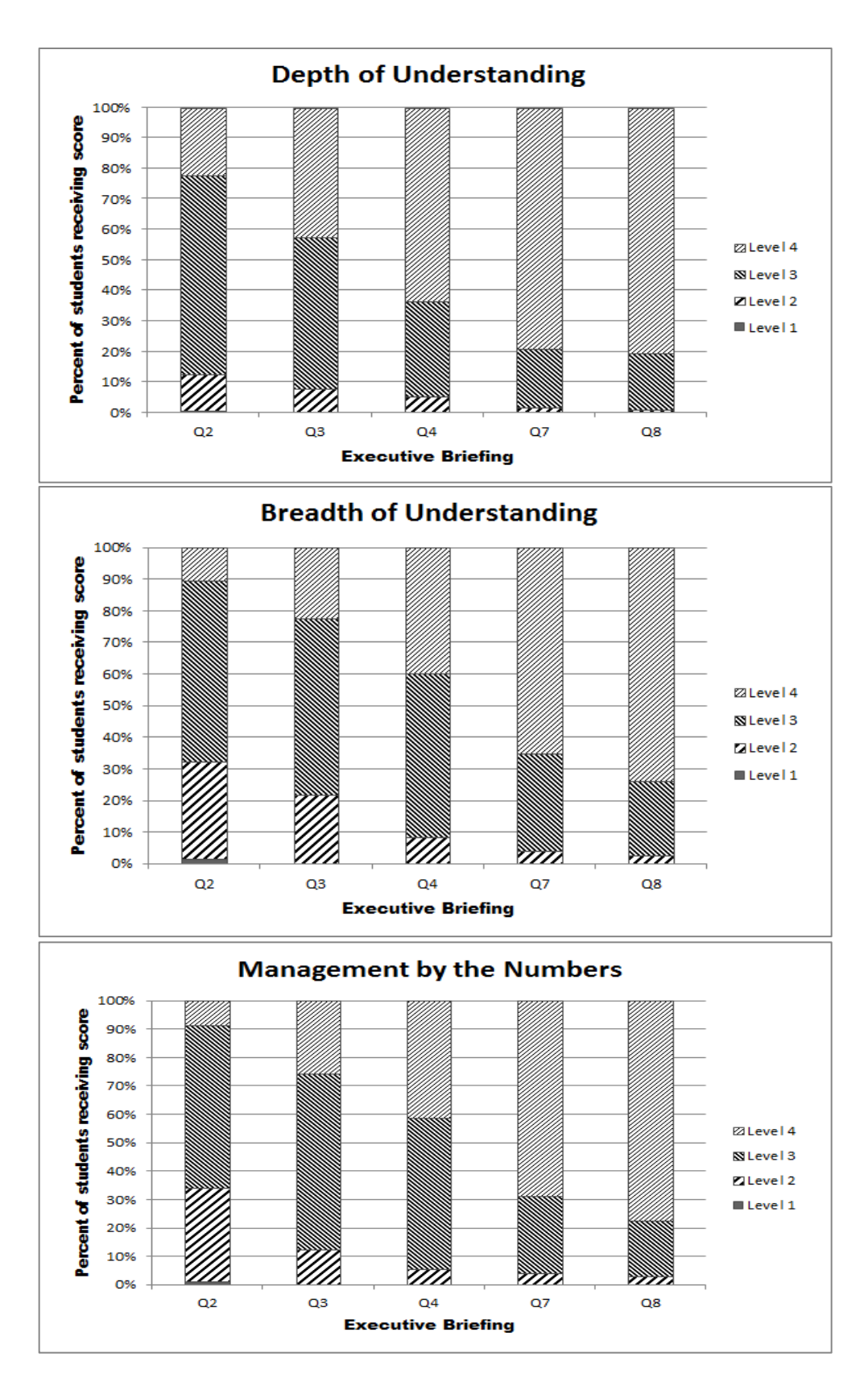
Figure 3: Executive Briefing Rubric Scores for 658 Students

Progression of Critical Thinking . From the data and our experience, we can say it is more difficult for the students to master cross-functional thinking and evidence-based, decision-making than to become